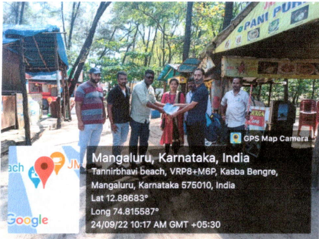
Figure 3 Handing over of Clean campaign bills to shopkeepers