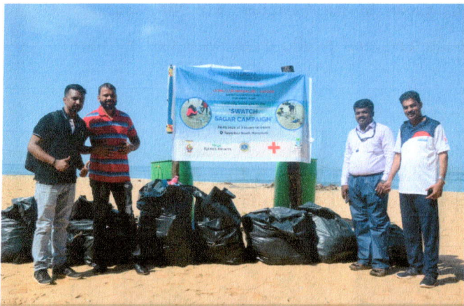
Figure 5 organisers with collected thrash