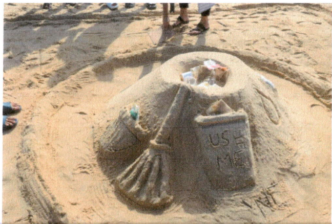
Figure 6 Sand art by YRC volunteers