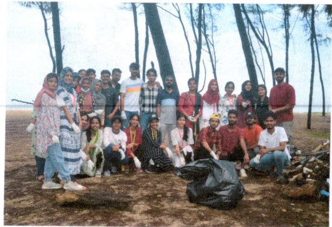
Figure 2 YRC Volunteers collecting thrash