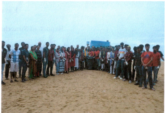
Figure 4 Group photo